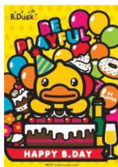
B. Duck B day B. Duck 生日咭