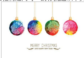
Xmas (New) 聖誕快樂