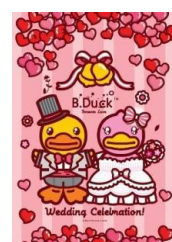
B. Duck Wedding B. Duck 婚禮咭