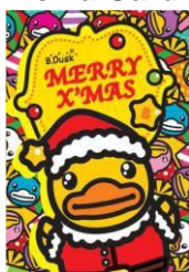
B. Duck Xmas B. Duck 聖誕節