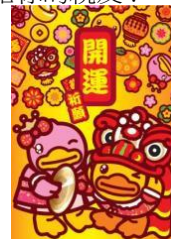
B. Duck CNY B. Duck 賀年咭