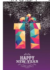
New Year 新年快樂