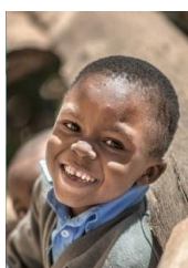
Happy boy 快樂小男生