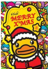
B. Duck Xmas B. Duck 聖誕節