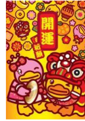
B. Duck CNY B. Duck 賀年咭