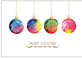
Xmas (New) 聖誕快樂