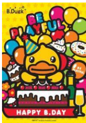
B. Duck B day B. Duck 生日咭