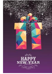
New Year 新年快樂