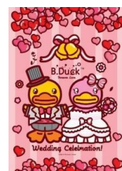
B. Duck Wedding B. Duck 婚禮咭