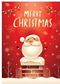
Hugging Santa 聖誕老人