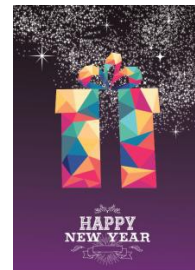
Near Year 新年快樂