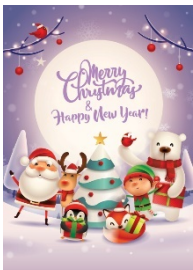
Christmas Wonderland 歡聚聖誕

B) Pick a Card 選購禮物之同時，請你挑選以下其中一款心意卡，送給你的親友：