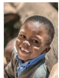
Happy boy 快樂小男生