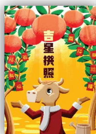
CNY Ox 新年快樂 - 牛