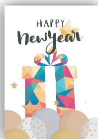
Happy New Year 新年快樂