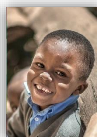
Happy boy 快樂小男生