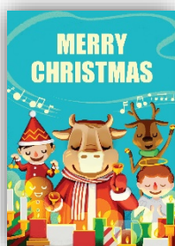
Merry Christmas Ox 聖誕快樂 - 牛

B) Pick a Card 選購禮物之同時，請你挑選以下其中一款心意卡，送給你的親友：