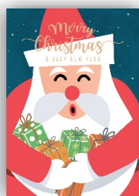
Merry Christmas 聖誕快樂