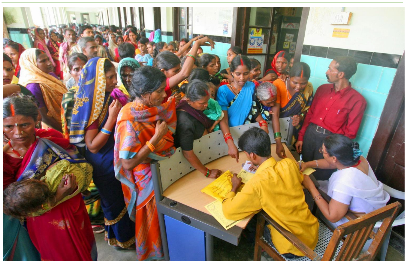
People waiting to get registered at Motihari District Government Hospital in East Champaran, Bihar, India. With so few doctors employed to work in the healthcare sector in India, this scene is typical. (2009)