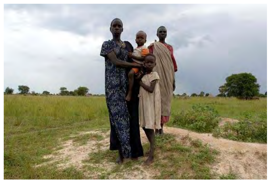
Survivors of an attack in Duk Padiet, Jonglei state