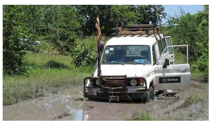
Poor roads on the outskirts of Rumbek, Lakes state. Maya Mailer/Oxfam, 23 September 2009

Source: Oxfam interviews with local government, UN and NGO officials and LRA-affected communities, Yambio, October 2009.