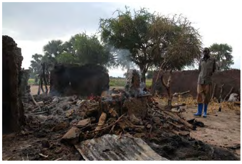
A burnt home in the aftermath of a raid, Duk Padiet, Jonglei state

Five years since the signing of the CPA, southern Sudan is experiencing a major upsurge in violence. In 2009, 2,500 people were killed and more than 350,000 displaced.<sup>4</sup> Despite efforts by the GoSS to contain insecurity as well as the presence of a UN peacekeeping mission, ordinary people, among them women, children, and the elderly, are being killed and abducted in brutal attacks. The insecurity is devastating a highly vulnerable population. Homes, livelihoods, and crops are being destroyed. Five years into the peace agreement, it is unacceptable that civilians are still not being protected from extreme levels of violence.