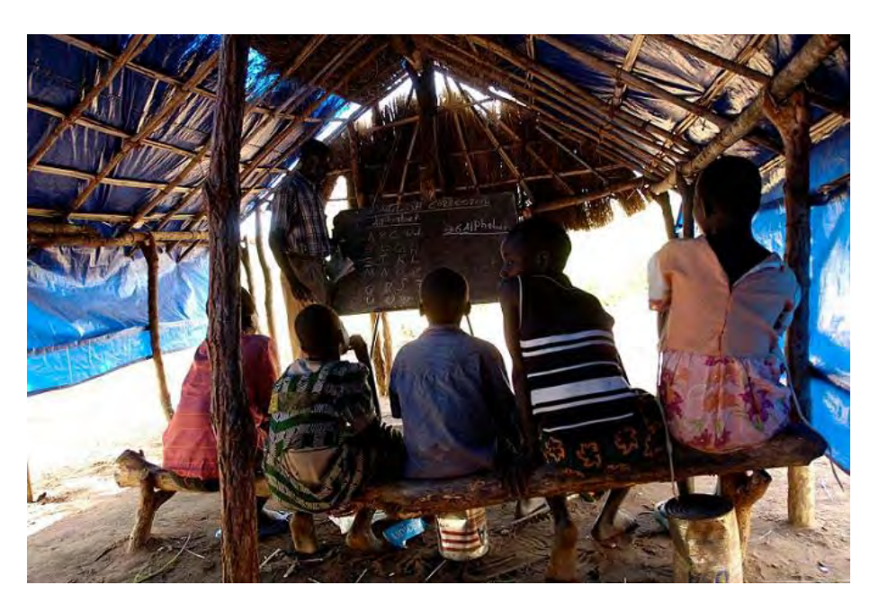
A tent school, Owiny Ki-Bul, Eastern Equatoria state. \ensuremath{\mathbb{C}} Tim McKulka, 26 October 2007

The international community and the GoSS have not delivered significant development to southern Sudan during the critical window of the CPA's interim period. This failure has in turn made communities more vulnerable to disasters. Expanded support to basic service provision through the referendum period and beyond is essential – not only to meeting the current needs of the people of southern Sudan, but in contributing to a sustainable peace.