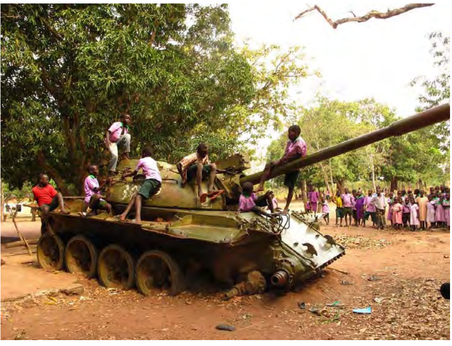
School children play on an abandoned tank, Mundri, Western Equatoria. 15 December 2009

With concerted and immediate action, the parties to the CPA and the international community can, and must, prevent a return to a devastating conflict. Now is the time to bring desperately needed security and assistance to the people of southern Sudan, and to build the foundation for sustainable development and, ultimately, a durable peace.