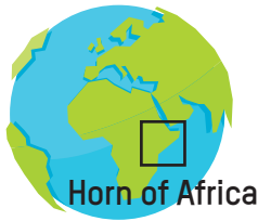
Horn of Africa