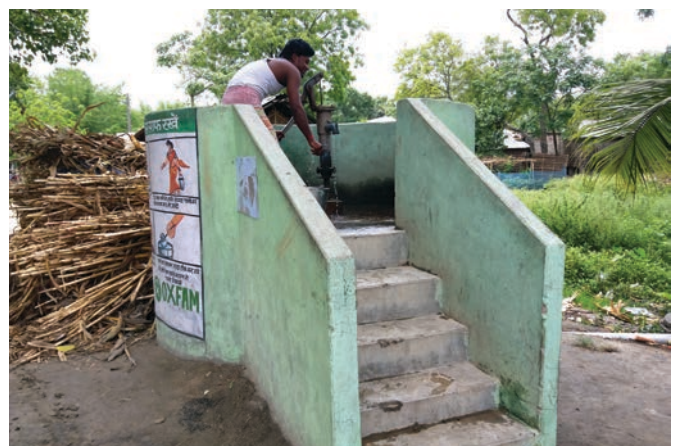
Placing wells on a higher platform can reduce the risk of water sources being polluted by flood water during the next monsoon season.