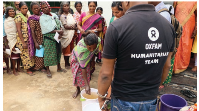
Oxfam staff and volunteers demonstrate the use of sodium dichloroisocyanurate (NADCC) tablets for water purification in the relief camp in Wayanad district's Kariyambadi colony, Kerala, India.