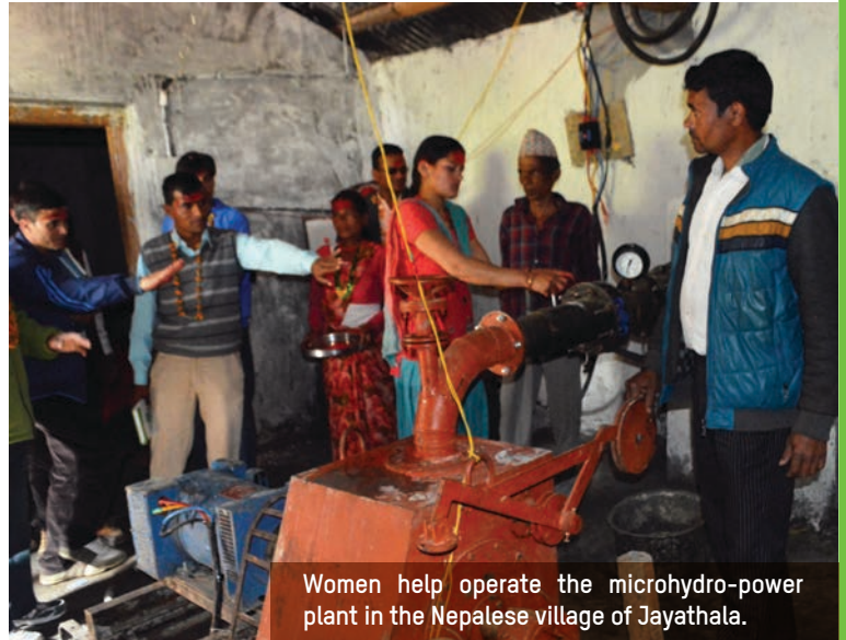
Women help operate the microhydro-power plant in the Nepalese village of Jayathala.