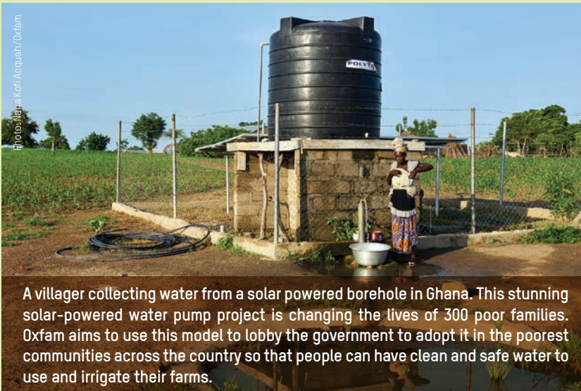
A villager collecting water from a solar powered borehole in Ghana. This stunning solar-powered water pump project is changing the lives of 300 poor families. Oxfam aims to use this model to lobby the government to adopt it in the poorest communities across the country so that people can have clean and safe water to use and irrigate their farms.