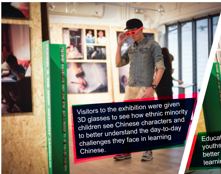
Visitors to the exhibition were given 3D glasses to see how ethnic minority children see Chinese characters and to better understand the day-to-day challenges they face in learning Chinese.

Please support Oxfam to petition the government for change in policy: http://doyoureadme.oxfam.org.hk/?page_id=63