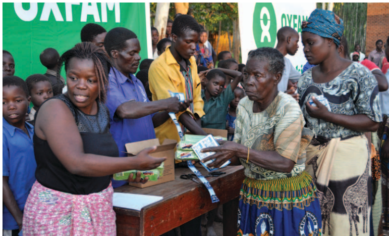
Oxfam provides relief supplies to people affected by the severe floods in Malawi.