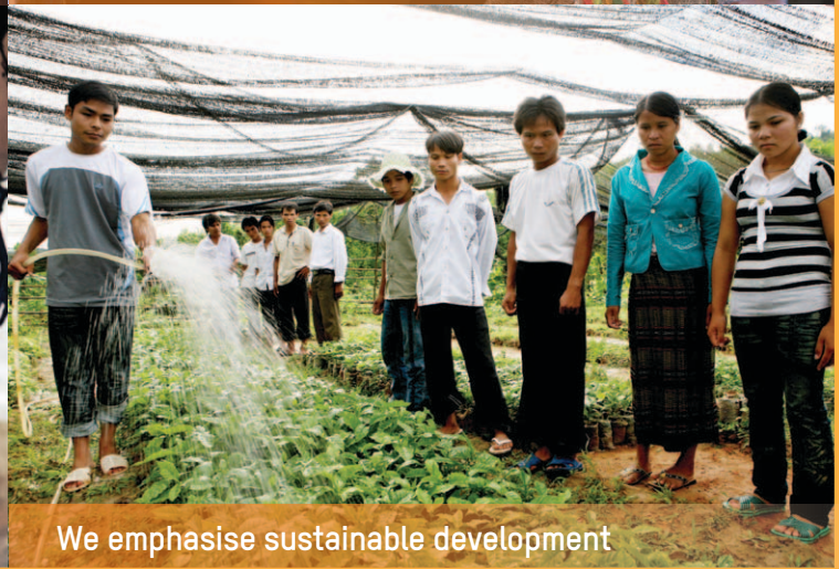
We emphasise sustainable development