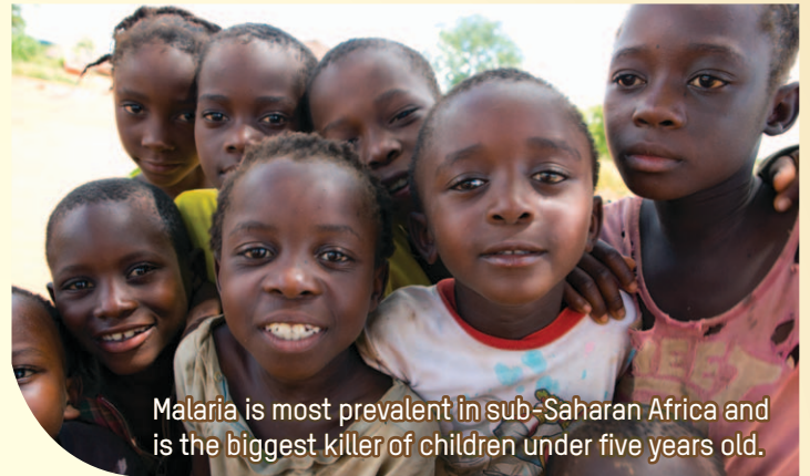
Malaria is most prevalent in sub-Saharan Africa and is the biggest killer of children under five years old.

And most importantly, the outlook is positive.