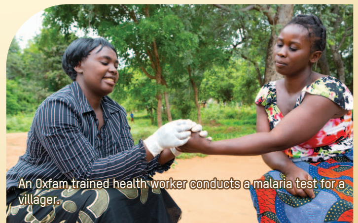
An Oxfam trained health worker conducts a malaria test for a villager.

As I listened to them, I realised that they are the Florence Nightingales of Zambia — passionate, committed, and beautiful.