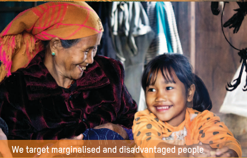
We target marginalised and disadvantaged people