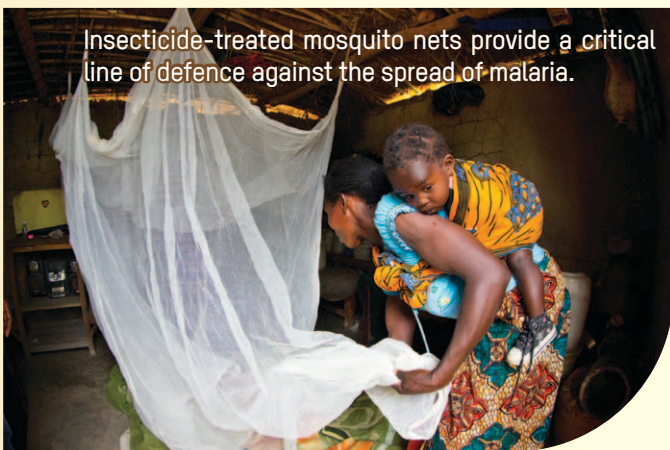
Insecticide-treated mosquito nets provide a critical line of defence against the spread of malaria.

Few people in Hong Kong know much about malaria though it is a common and life-threatening disease in many countries all over the world. According to the World Health Organization, about 600,000 people worldwide died from malaria in 2013, among them were 430,000 children. Malaria is most prevalent in sub-Saharan Africa as 90 per cent of the world's malaria cases are concentrated in this region.