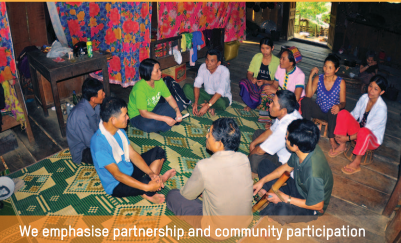
We emphasise partnership and community participation