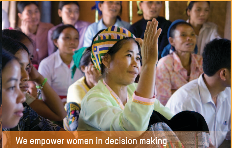
We empower women in decision making