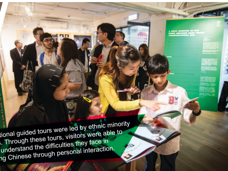
Educational guided tours were led by ethnic minority youths. Through these tours, visitors were able to better understand the difficulties they face in learning Chinese through personal interaction.