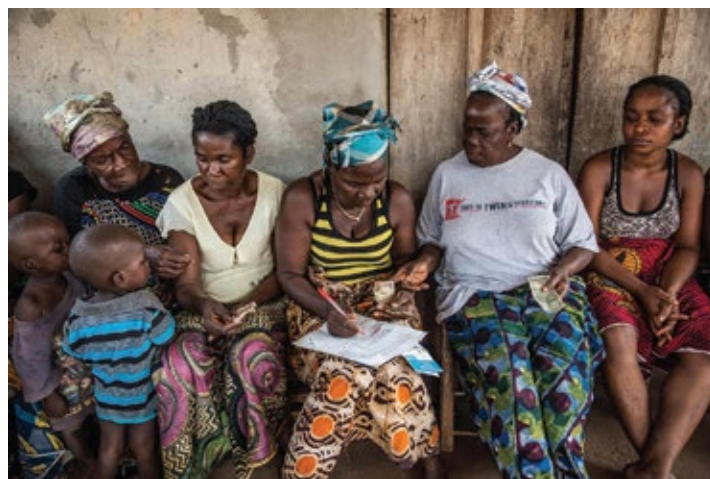
A women's savings group in Liberia.

Oxfam supported women in Sierra Leone and Liberia to set up women's groups, and training was provided. We seek to strengthen the capacity of women's networks to raise awareness of women's land rights, and advocate for greater participation among women in the decision-making process on property ownership. We also promote local governance through female political empowerment.